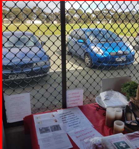
Photos from the Milang Red Cross 'Cheer-Up' Hut. Well worth a visit. Open on Wednesday mornings and Saturdays